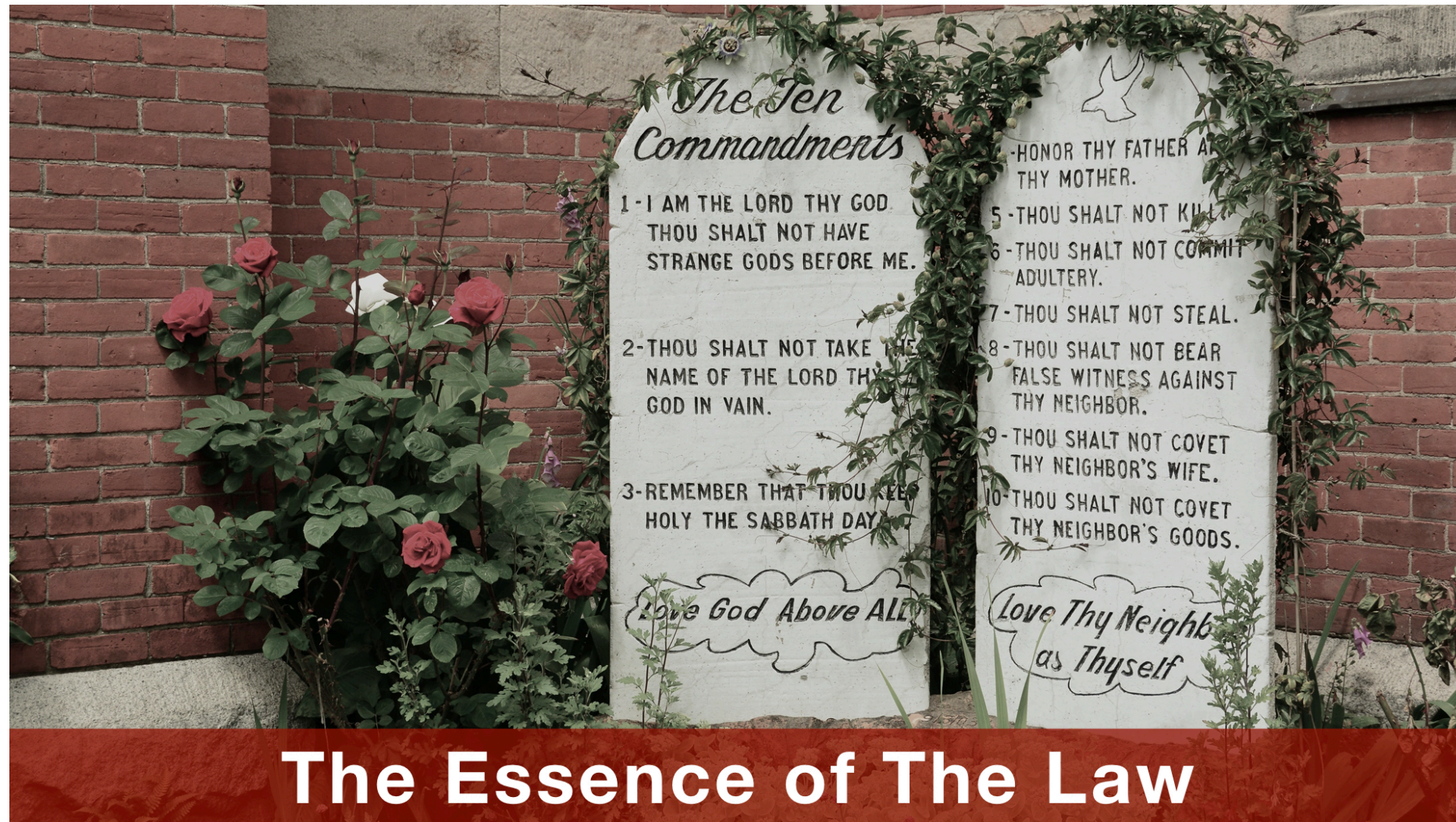
The Essence of The Law